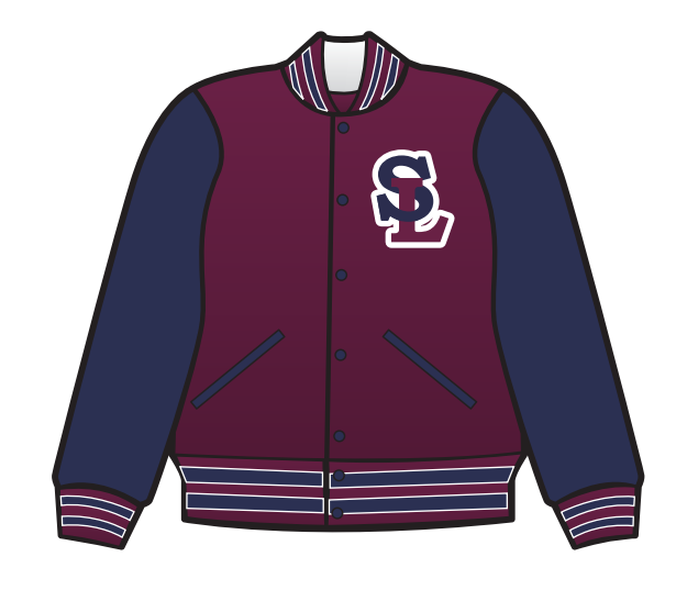
Custom Jackets can be ordered for an additional fee and take 6-8 weeks to complete.

Jackets start at $249 and can be ready in as little as one week.