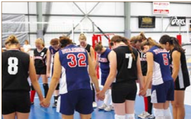
The 2010 SLHS volleyball team is joined by the Excel Christian volleyball team as they prayed prior to their game.

Please pray about how God might use you to make an ETERNAL difference in the lives of His children by equipping them with the "Whole Armor of God."